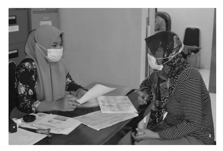
Figure 4 Form Filling Directions

assistant makes steps. Before carrying out the Assistance for making NIB, MSME actors are asked to fill out a form and attach a photocopy of their KTP and Family Card. The Facilitator also gives MSME actors a little guidance regarding the NIB. The time given by the companion is August 23, 2021, to August 26, 2021.