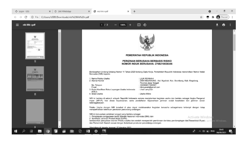
Figure 8 NIB results

village officials also feel the positive impact of the assistance in the making NIB, as Mr. Tanto said that the application is relatively easy to use and can be a lesson for other devices.