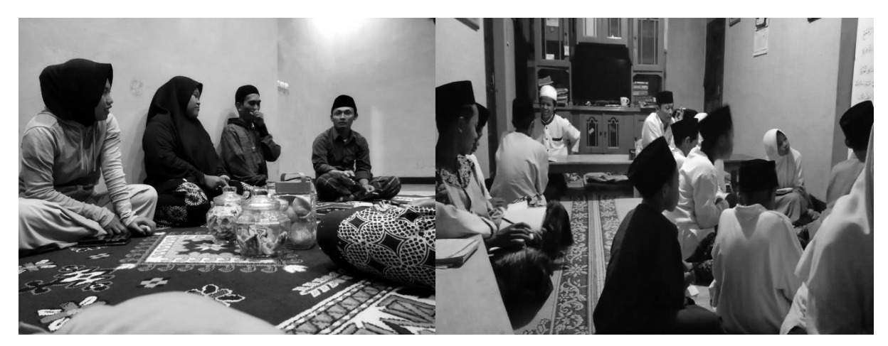
Gambar 1. Discovery

awaken children who have been wrong in the association. This is corroborated by observations that result in a lack of parental attention to children.